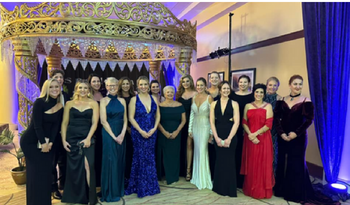
2023 Ball of the Year Committee