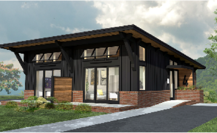
Rendering of the NEW Mon Health Caring Cottages

On October 28, the Mon Health Medical Center Auxiliary held the 59th Annual Ball of the Year supporting the development of the Caring Cottages, the new patient family stay houses to be situated on the Mon Health Medical Center campus. With Hope Gas as the Presenting Sponsor, and the generosity of all the sponsors and guests, the Auxiliary raised over $500,000 for the project.