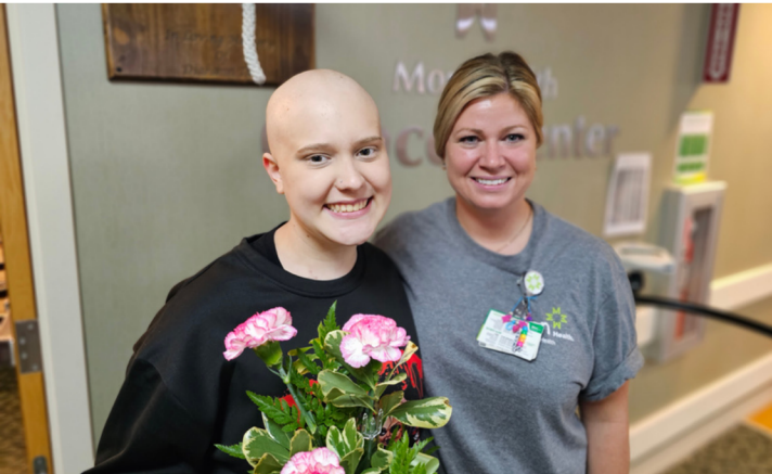
Oncology patient and nursing team celebrate ringing of the bell

The Caring Cottages, constructed by West Virginia-based manufacturer Omnis Building Technologies, will provide a home away from home for families of patients undergoing extensive treatments, and offer a warm and welcoming environment that allows them to remain close to their loved ones throughout their medical journeys.